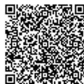
FISH FRY QR CODE: